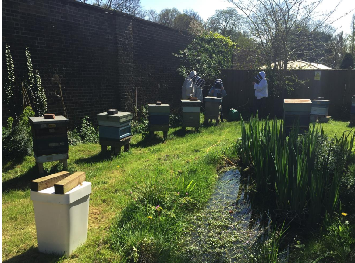
Photographs Alison Kahane