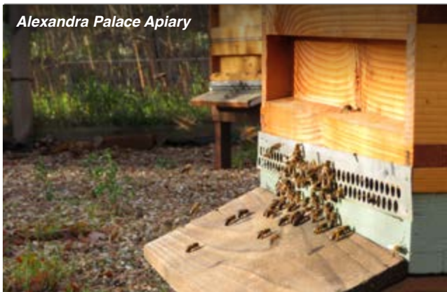
Alexandra Palace Apiary